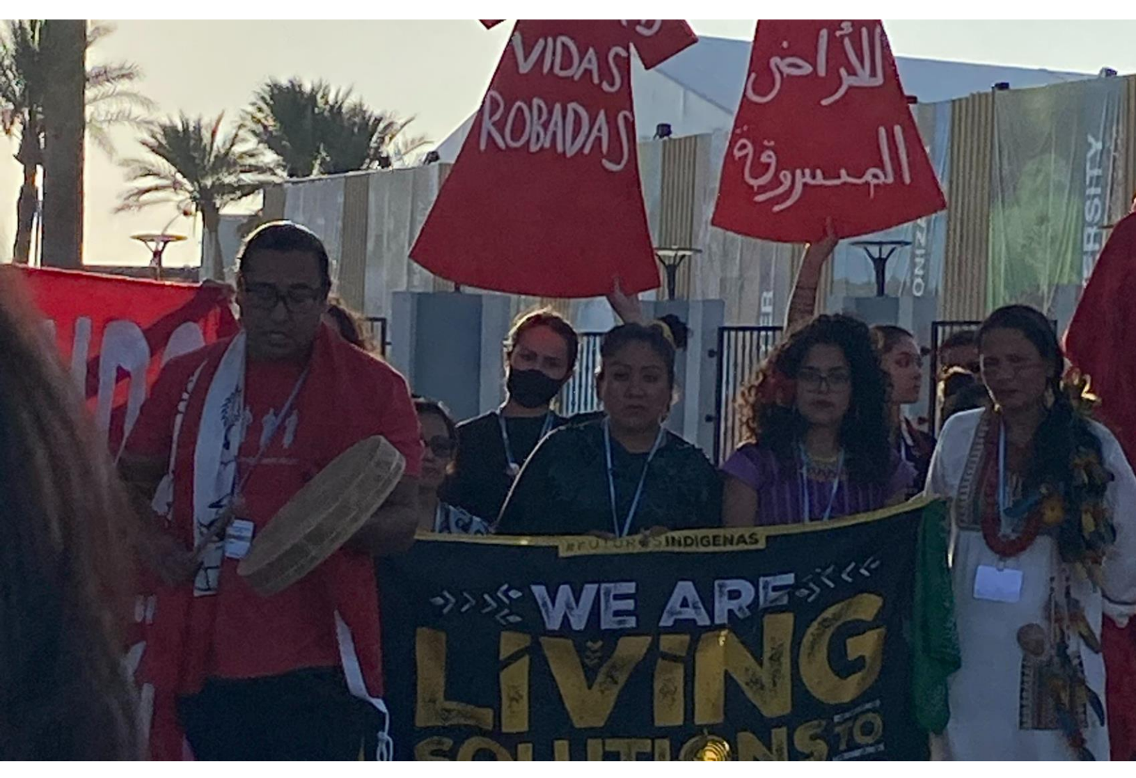
Delegates participated in, No more Stolen Sisters and Stolen land, a public action at COP27