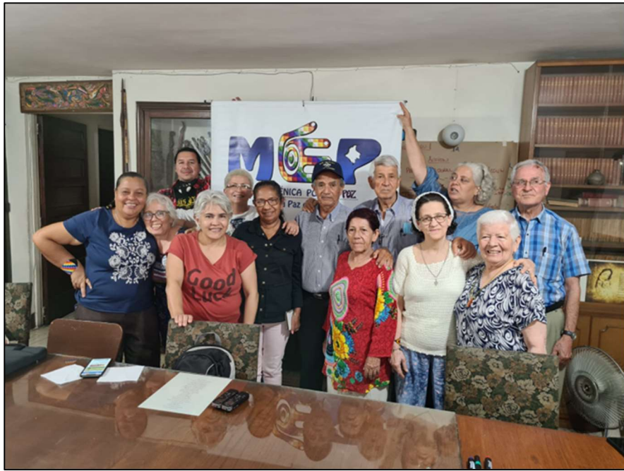
Picture caption: In-person meeting with National Animation Team. Usemi House. Oct. 9-10, 2021. Medellín-Antioquia.