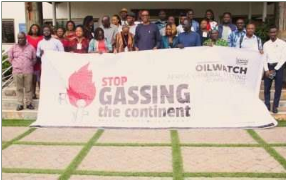
Picture caption: Oilwatch Africa members advocating against Gassing the African Continent