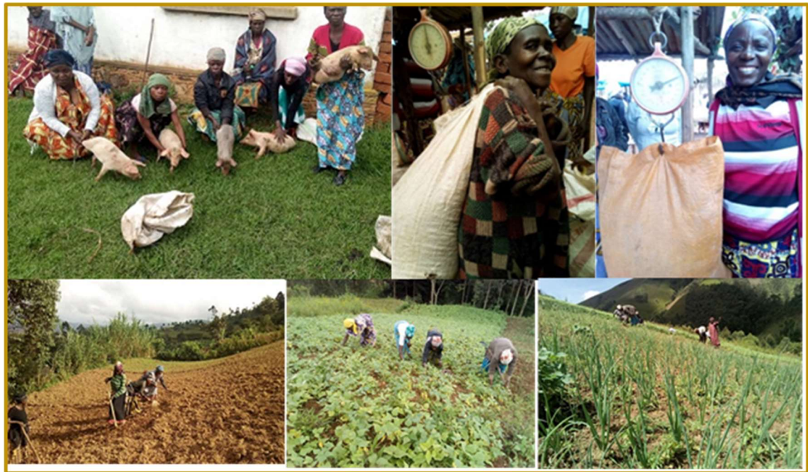
Picture caption: the women of Heritiers de la Justice SALVIS PDF during their income-generating projects.