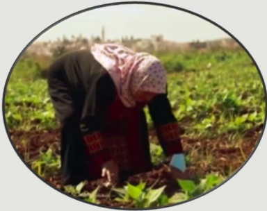
Picture caption: The Department of Service to Palestinian Refugees (DSPR)