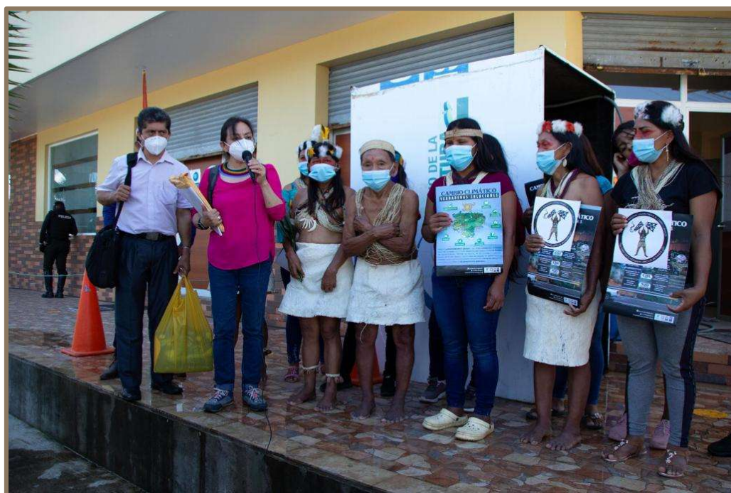
Picture caption: delivery of the demand for climate change against the China Petrooriental company by Waorani communities in the Amazonian region on Ecuador.

KAIROS provided support for the climate justice program by strengthening the Amazonian peoples' resistance to oil expansion and making visible through networks the importance of leaving oil in the subsoil.