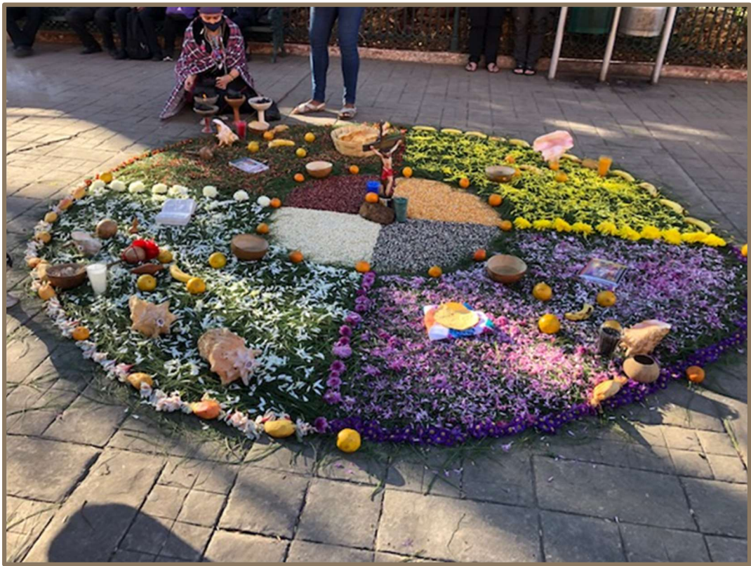
Picture caption: January 25, 2022. The annual pilgrimage for Peace of the diocese of San Cristobal de las Casas, Chiapas.