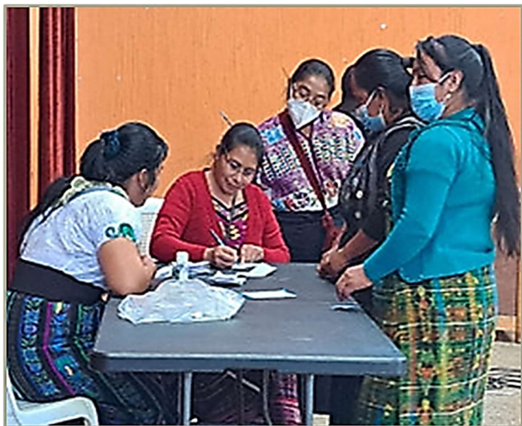
Picture caption: Elected representatives to the Municipal Council - COMUDE (August 30 th , 2022)