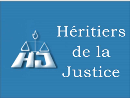
Héritiers de la Justice (HJ)