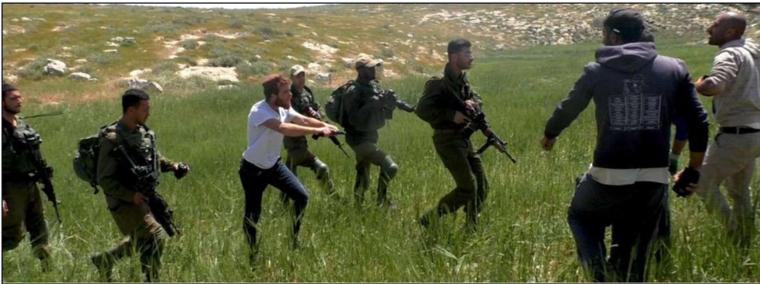
Picture caption: Armed Israeli settler accompanied by soldiers threaten farmers near a-Tawani, South Hebron Hill, April 18 th , 2020.