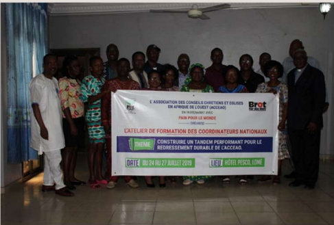
Picture caption: FECCIWA members attending a training workshop for national coordinators.

The goals of the project were to raise awareness of adaptation and resilience strategies to climate change in Christian Councils; to build the capacity of youth to develop effective ways of planning and managing green initiatives; and to advocate for the active involvement of West African governments and church leaders in addressing the climate crisis.