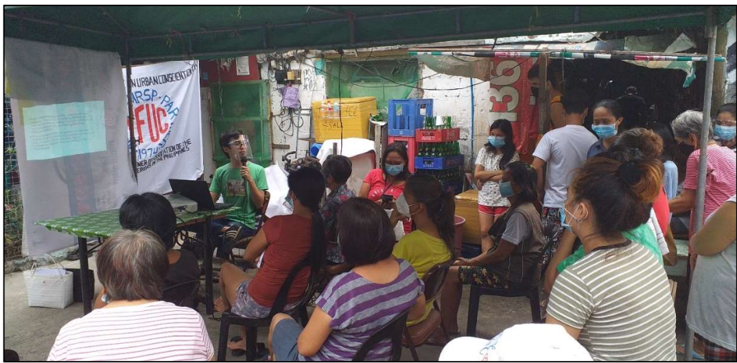
Picture caption: EcuVoice meeting with members of Rise Up for Rights and Life, an organization of families of victims of killings related to the “war on drugs”.