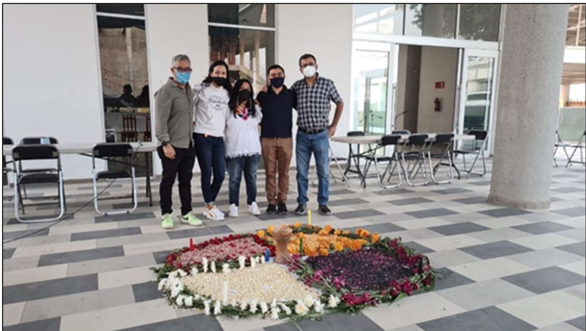
Picture caption: January 25, 2022. The annual pilgrimage for Peace of the diocese of San Cristobal de las Casas, Chiapas.