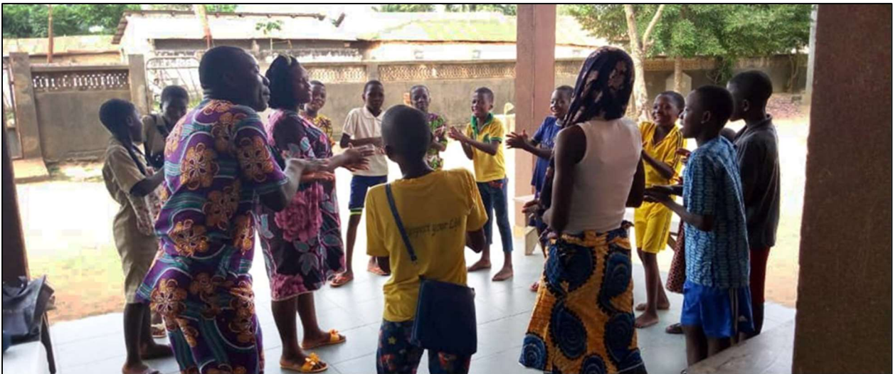
Picture caption: FECCIWA members attending a training workshop for national coordinators.