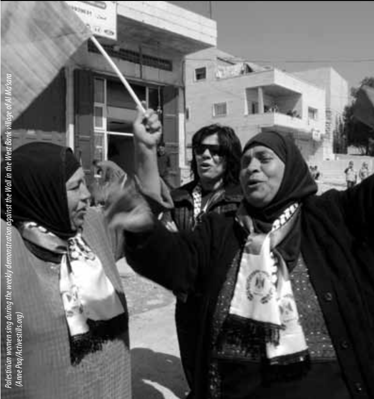
Palestinian women sing during the weekly demonstration against the Wall in the West Bank village of Al Masaana