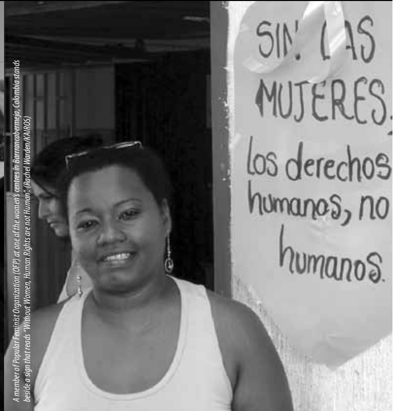
A member of Popular Feminist Organization (OPF) at one of the women's centres in Barrancabermejo, Colombia stands beside a sign that reads "Without Women, Human Rights are not Human."