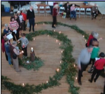
Part of the 2012 Advent Garden at Trinity-St Paul's United Church, Toronto.