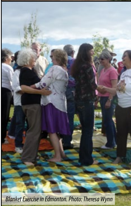
Blanket Exercise in Edmonton.

This year, KAIROS invites you to join us in an exploration of the Advent Garden tradition as we explore our relationship with the Earth and all who dwell in it. This resource features activity ideas and worship materials around four justice themes: World AIDS Day, Right Relationship, Water, and Radical Discipleship. It will focus on the four traditional advent themes of hope, peace, joy, and love as well as the Advent Garden practice of honouring elements of the natural world: minerals, plants, animals, and human beings. And it all ends with us building an Advent Garden in which to journey together. Available as both print and PDF in September 2013. Email orders@kairoscanada.org to make sure you are notified as soon as it's released!