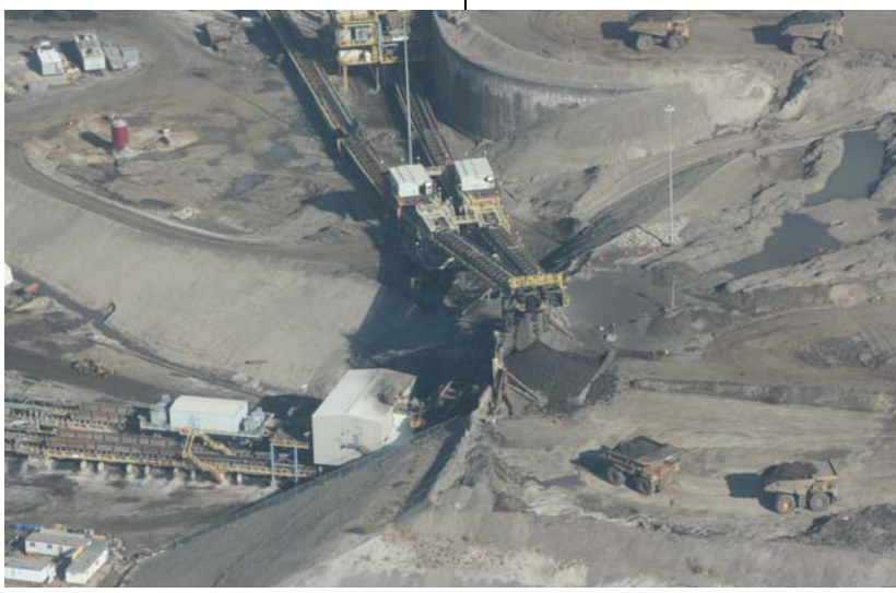
While the Alberta tarsands, one of the world's largest industrial projects, do provide economic benefits for Indigenous peoples, there are also concerns about the negative impacts on the health and water of the land.