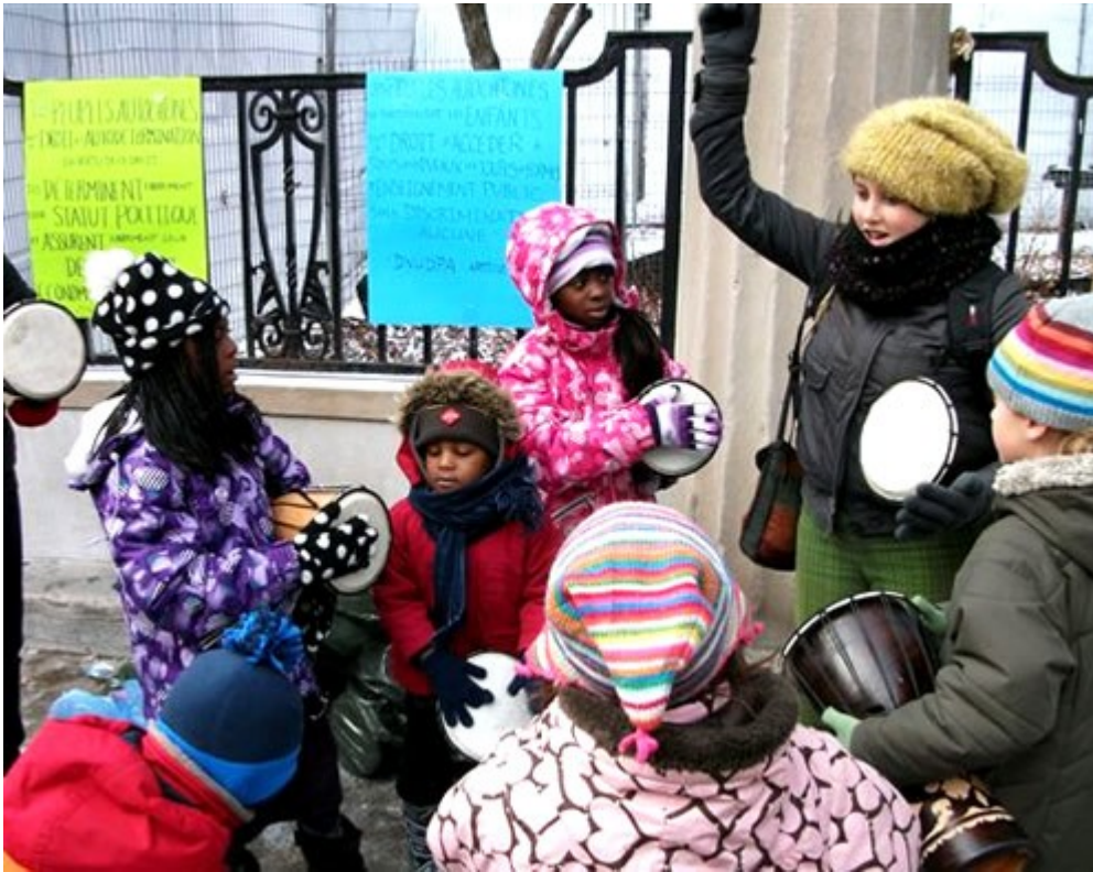
The Children of the World chorus at the Montreal City Mission December 5 drumming circle, McGill University campus

Many thanks to the dozens of groups who hosted a Beat the Drum action in support of climate justice and the UN Declaration on the Rights of Indigenous Peoples December 4 and 5. We know there are a few more creative events yet to come.