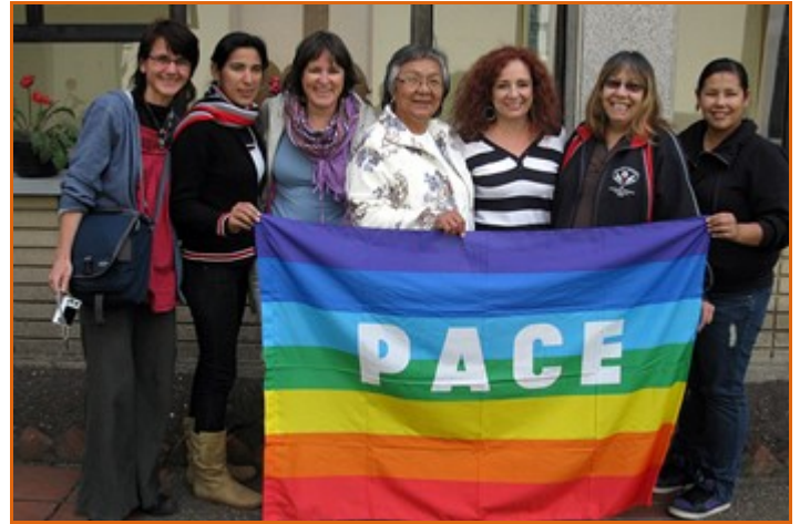
Women & People's Summit of the Americas against Militarization Delegates, Colombia, August 2010

* Follow KAIROS weekly 'Spirited Reflections' blog >>